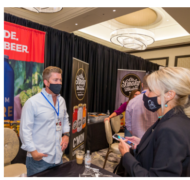
Between vendors and attendees, there was no shortage of people to meet and brands to explore!