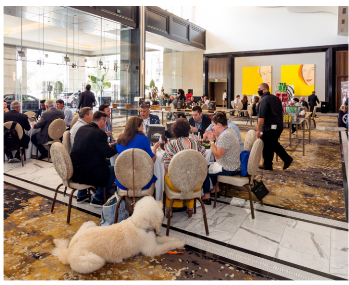
Enjoying a stellar repast at the luncheon as Buddy , the Bird Dog Whiskey mascot looks on

"The event was well planned and well executed, and communication before, during and after the event from PHCP was stellar. The layout was functional and allowed for spacing. The panel before the trade show was insightful and provided some great information!"